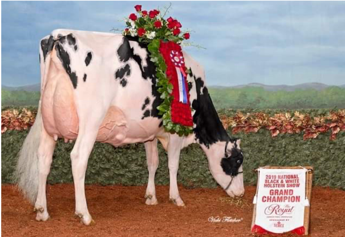
Idee Windbrook Lynzi EX-95 Sister to Dam of Lot 20