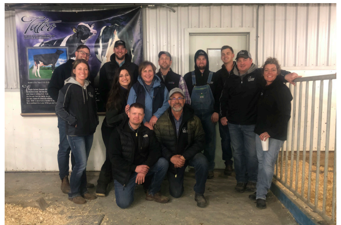
2020 Sale Crew and Host