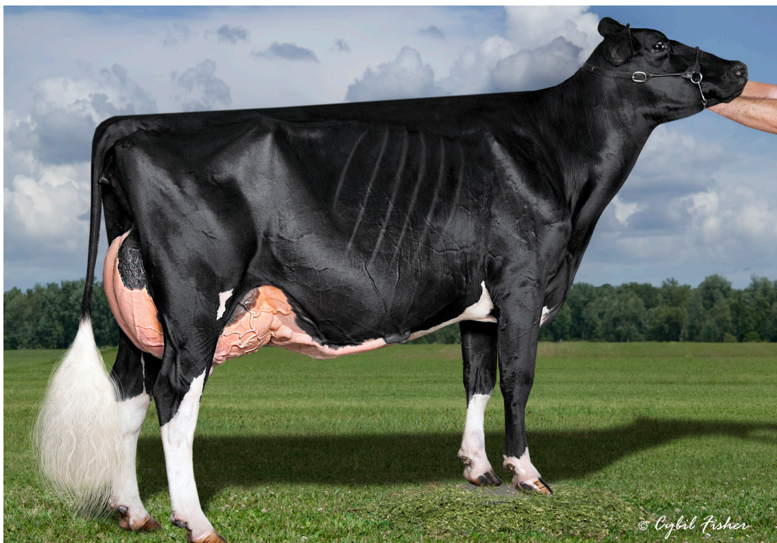
Fradon Armani Jordey-ET EX-94 GR Dam of Lot 17