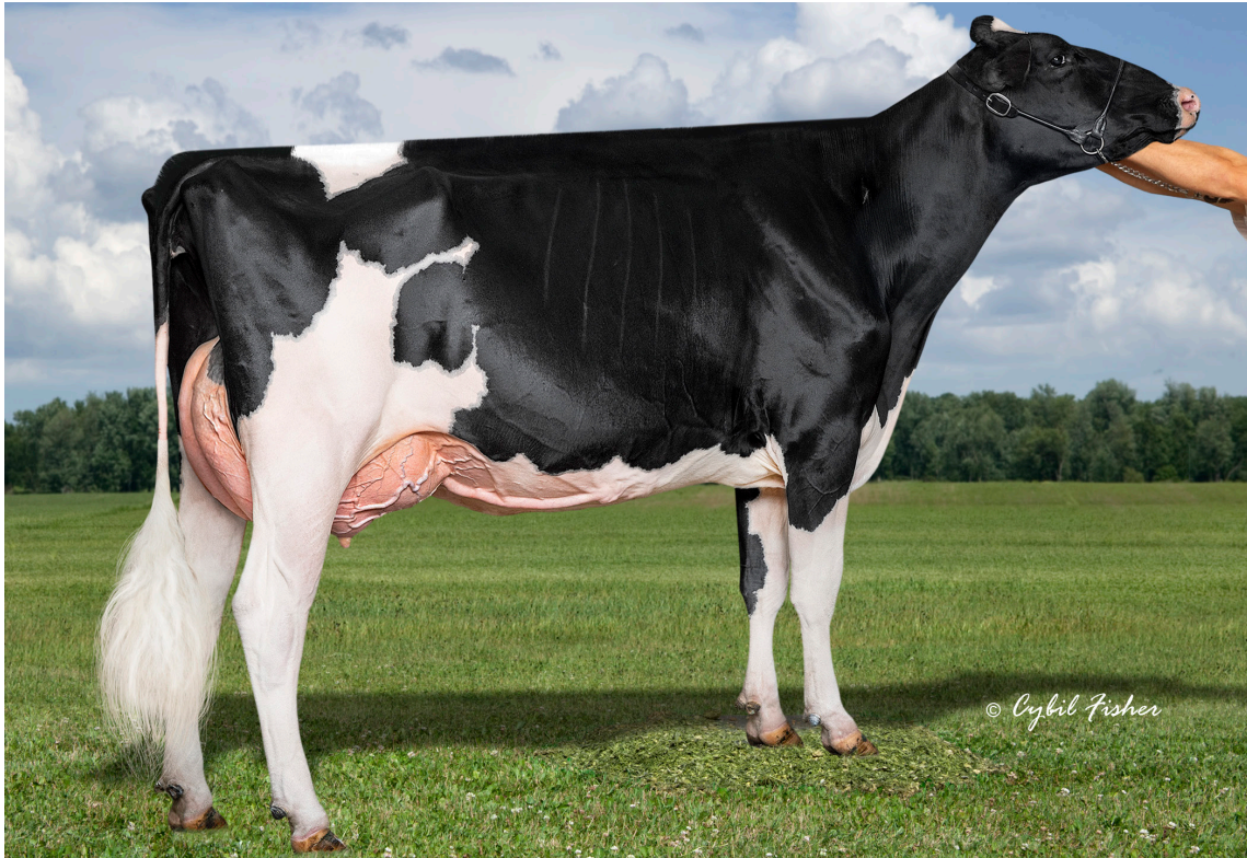
Duckett Doorman Sadie-TW EX-92 Dam of Lot 27