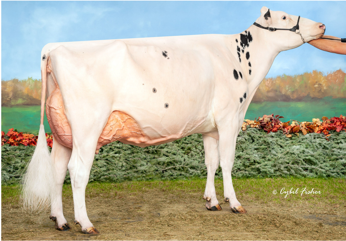
Carldot Bautista Emma EX-94 Dam of Lot 28