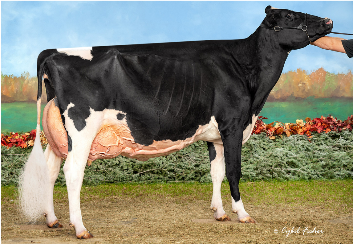
Ms Beautys Black Velvet-ET EX-96 Dam of Lot 1