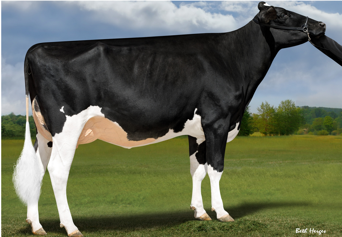
Willswikk Sdk Chardonnay-ET EX-92 Dam of Lot 8