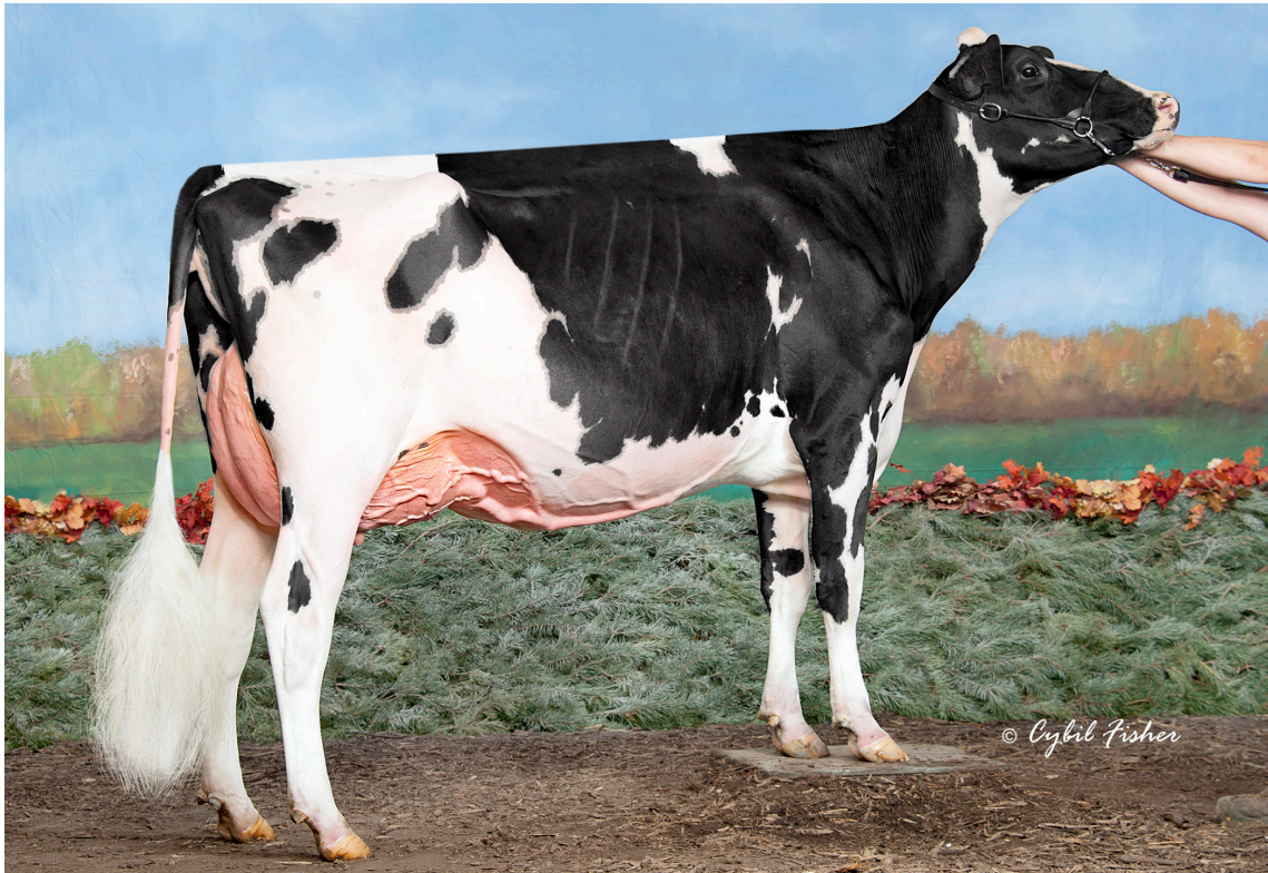
Duckett Solomon Leta EX-94 Dam of Lot 26