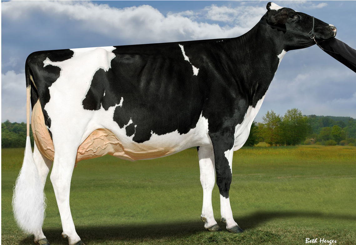
Idee Doorman Lysa EX-94 Dam of Lot 19