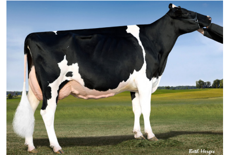
MD-Maple-Dell Iris EX-92 GR Dam of Lot 23

3rd Dam: MD-Maple-Dell Iris EX-92 4th Dam: MD-Maple-Dell Encore Ina EX-95