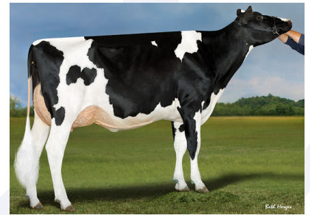
AOT Challengr Hadley-ET Dam of Lots 37-40

TPI 2986 PTAT + 2.87 UDC + 2.53 CFP + 149 DPR + .9