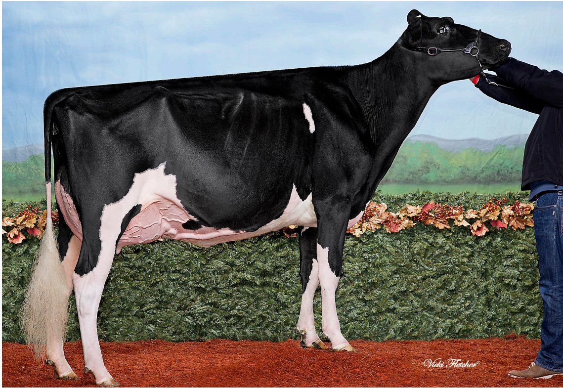
Knonaudale Orangecrush EX-93 GR Dam of Lot 25