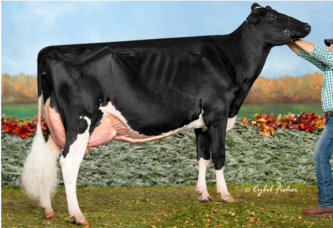
Springbend Aftershock Danica EX-94 GR Dam of Lot 35