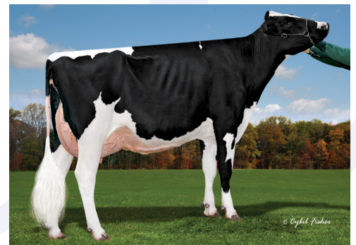
Cookiecutter DTA Habitan-ET GR Dam of Lots 37-40

TPI 2974 PTAT + 2.43 UDC + 2.60 CFP + 129 DPR + 1.1