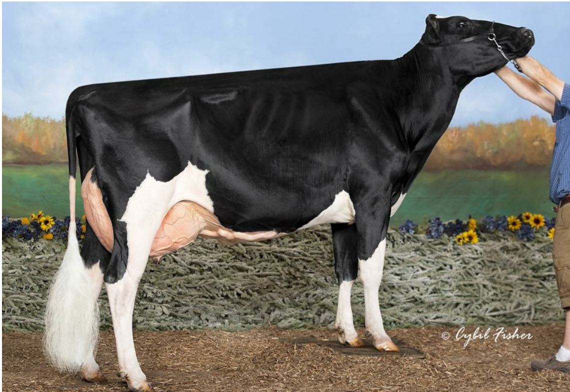
Ran-Can Alexander Clair-ET EX-92 GR Dam of Lot 36