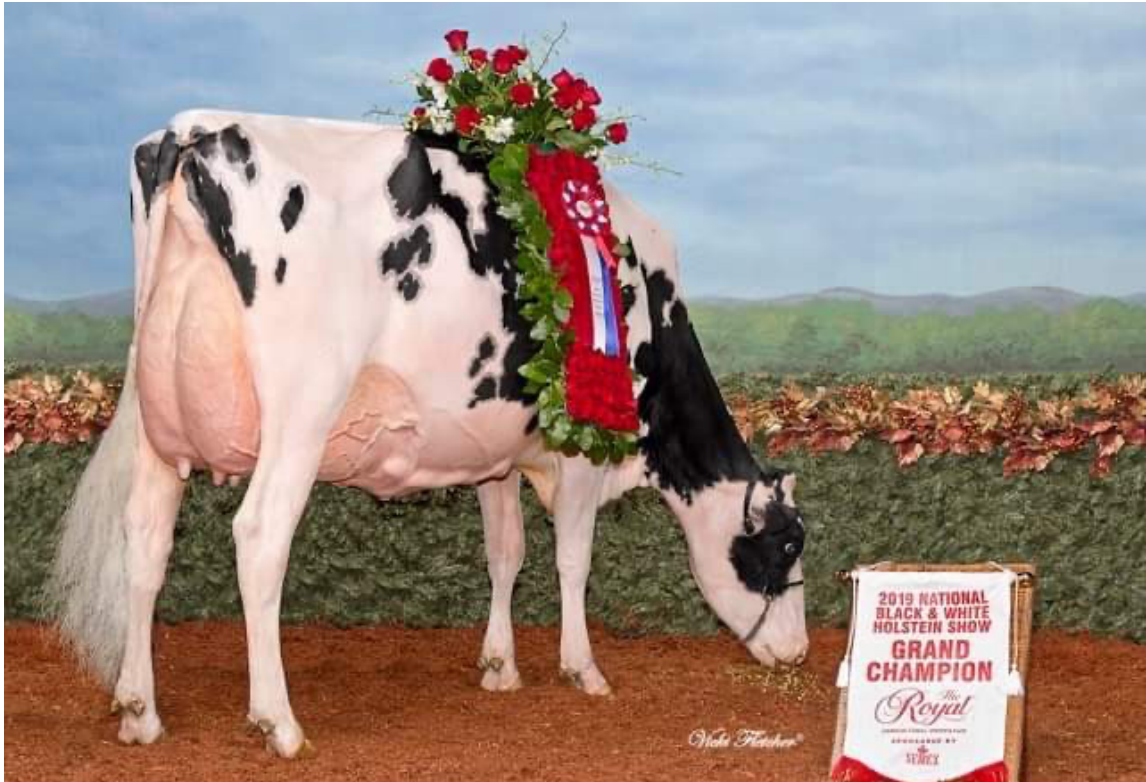
Idee Windbrook Lynzi EX-95 GR Dam of Lot 11 & 12